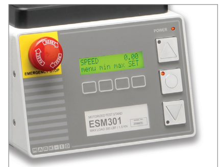
^ Digital controller contains a backlit LCD screen with menu choices for ease of setup and operation

^ The ESM301 and ESM301L are shown in typical configurations with Series 5 digital force gauges and G1008 film & paper grips